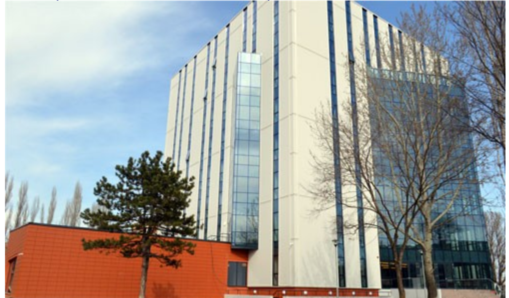
a) Naming - They recently changed their name from "Universitatea POLITEHNICA din București" to "Universitatea Națională de Știință și Tehnologie Politehnica București"